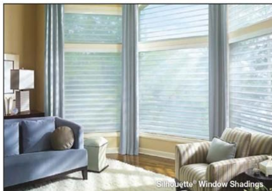
Silhouette® Window Shadings

Now more than ever, gardeners are embracing organic methods to grow their food. To enjoy a productive harvest, though, requires a basic understanding of your garden and its requirements. At this point, many would-be gardeners groan inwardly and give up. The dream of enjoying home-grown fruits and vegetables can drown in the frustration of sifting through endless sources of often-contradictory advice and overly-generalized information.