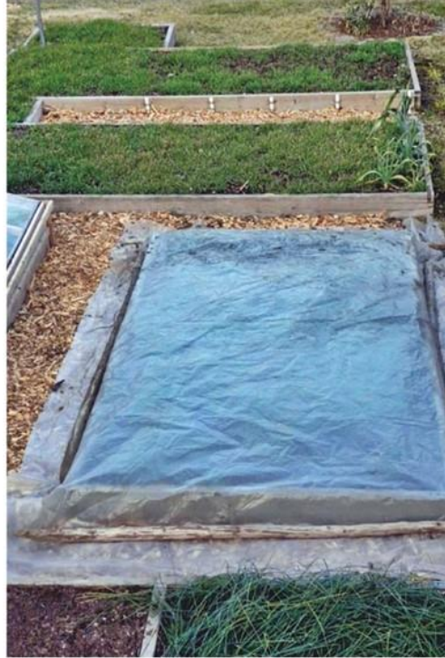
Location, soil preparation, seed propagation, designing raised beds, are important consideration for success.

For example, it is common knowledge that most above-ground vegetables enjoy warm, fertile accommodations. But how warm? And what exactly constitutes fertility? The Complete Organic Garden answers these questions in a straight-forward manner. Most vegetables prefer between 7 and 10 hours of full sunlight per day (minimally, 10 a.m. – 4 p.m.). As Nick points out, “If light intensity declines... production is affected.” He further explains that, for maximum production, plants must “extract nutrients from the soil.” Building the optimum soil is a key component of successful organic gardening. Nick advises that the best soil is light and crumbly, about the consistency of chocolate cake! In addition to explanations, photos and illustrated instructions, Nick provides a detailed reference list detailing organic fertilizers and soil amendments. For example, AZOMITE® is a natural product mined from an ancient mineral deposit in Utah and is OMRI-Listed for certified organic production. AZOMITE contains a broad spectrum of over 70 minerals and trace elements, distinct from any mineral deposit in the world. AZOMITE® trace minerals are beneficial to root systems, plant yields and overall plant health. (Read more at http://azomite.com/ ). And this is only the first organic component Nick discusses in a list